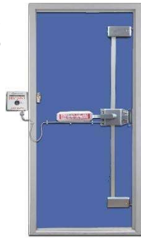
TEL - 110, TEL-210