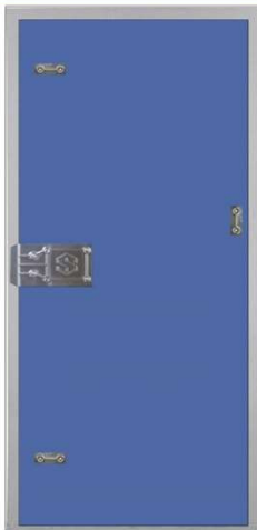
Standard Anti-Pry Plate