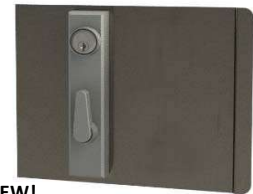
NEW! TEL-MTT -AP